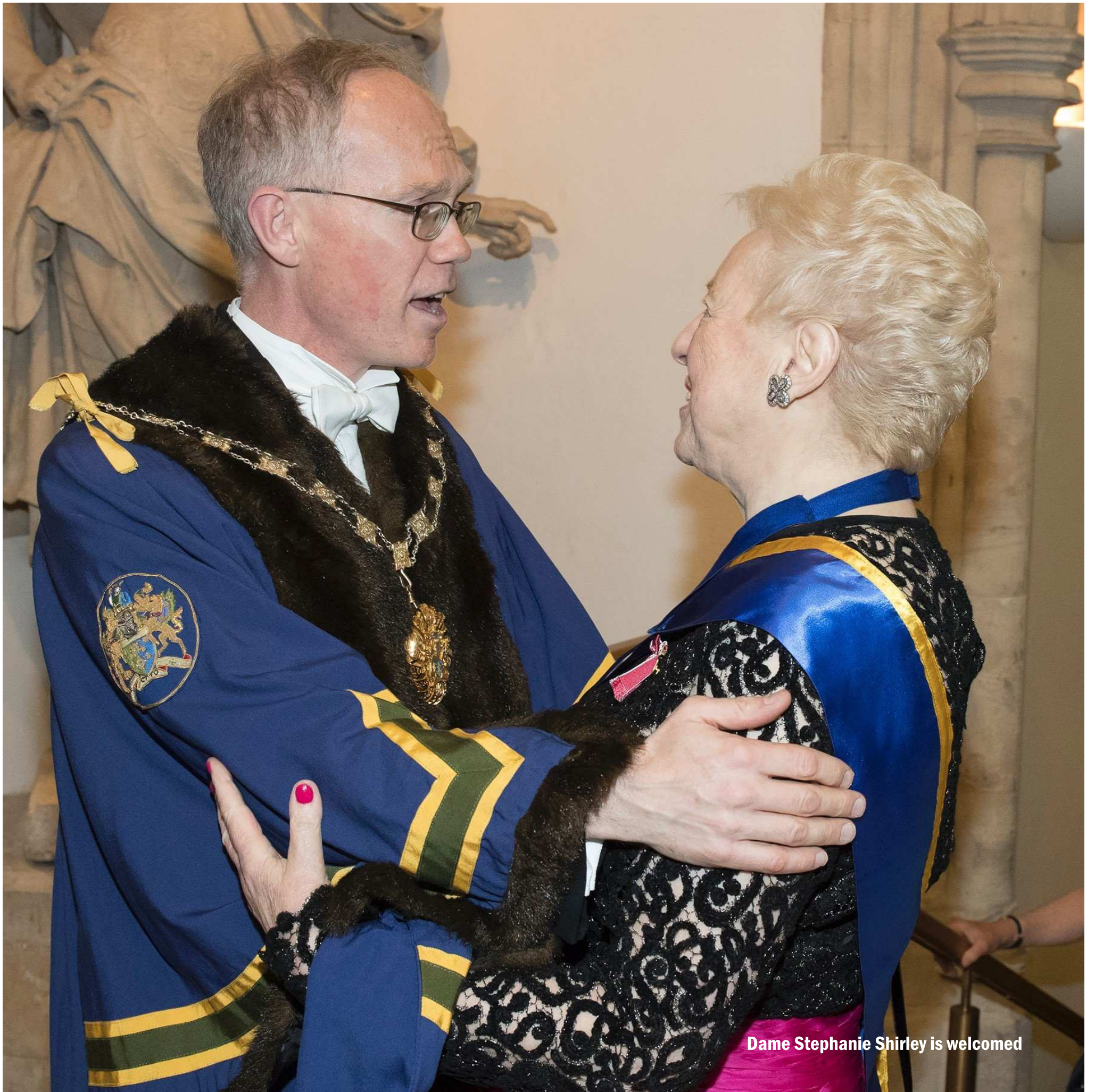
Dame Stephanie Shirley is welcomed